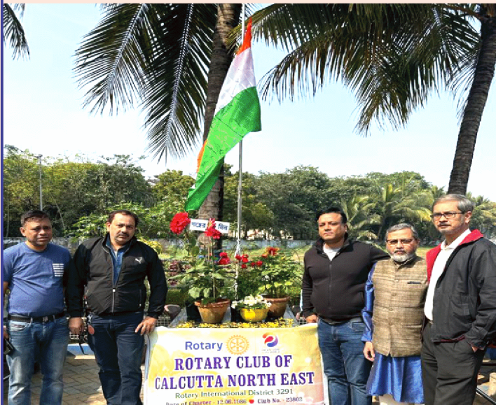
Republic Day celebration on 26.01.24.